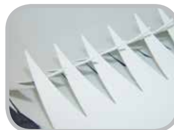
Punches precise fingers