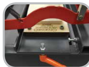
Easy positioning and clamping